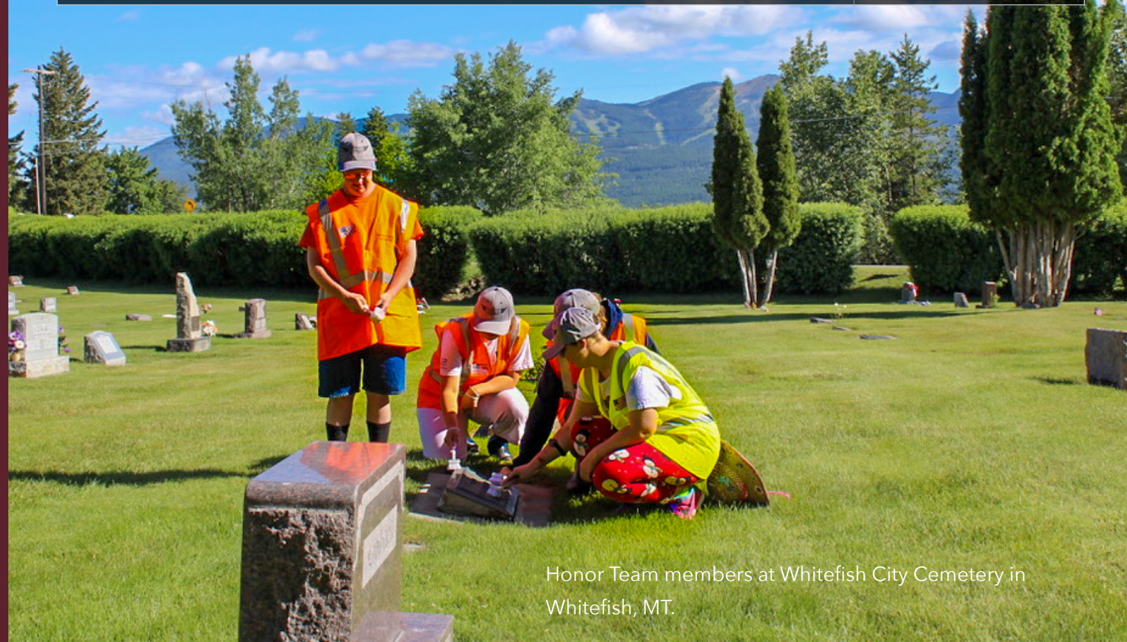
Honor Team members at Whitefish City Cemetery in Whitefish, MT.